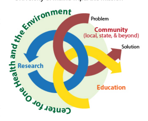
University of Maine Tripartite Mission

Although we were requested to submit separate research and educational proposals, this initiative is specifically designed to meet the tripartite mission of the land grant university of research AND teaching and outreach. The research focus is aimed at addressing critical emerging issues for the state and beyond related to plant, animal, and human health impacted by climate and other environmental factors affecting ecosystem change, of relevance to all of the major industries and constituencies within the state. As we build in this area in the future, we have specifically identified key positions that both: a) provide pivotal expertise for synergizing collaborations across biophysical and social science research faculty addressing these issues, and b) also meet critical teaching need in high demand programs in health sciences. Our