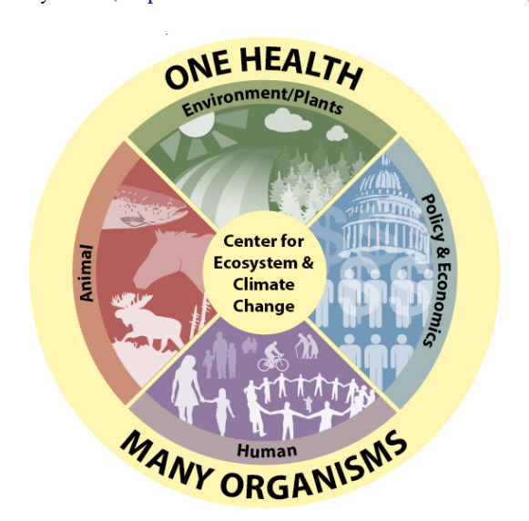
Center for ONE HEALTH and the ENVIRONMENT at UMaine

The University of Maine stands poised to address these emerging issues with the establishment of the "Center for One Health and the Environment". Our proposed emerging, interdisciplinary research and educational area, "Ecosystem and Climate Change: Impacts on Plant, Animal and Human Health", builds on the theme of the One Health Initiative, "an international movement expanding collaborations and communications in all aspects of health care for humans, animals and the environment" in order to "advance health care for the 21<sup>st</sup> century and beyond" (http://www.onehealthinitiative.com/).